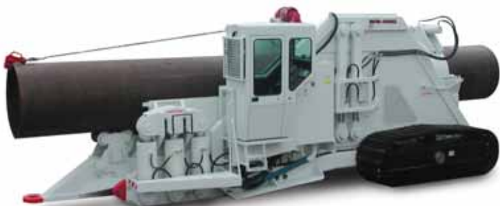
SPB 48-60 Millennium Series shown with optional cab